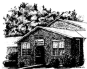
The Old Rock School - Home of the WBS

This institution is an equal opportunity provider